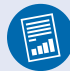
Single Study Review

A single study review of an individual study includes the WWC's assessment of the quality of the research design and technical details about the study's design and findings.